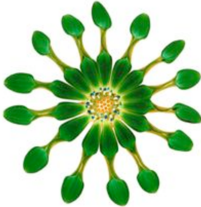
Renato Grome, Virtue , 2006