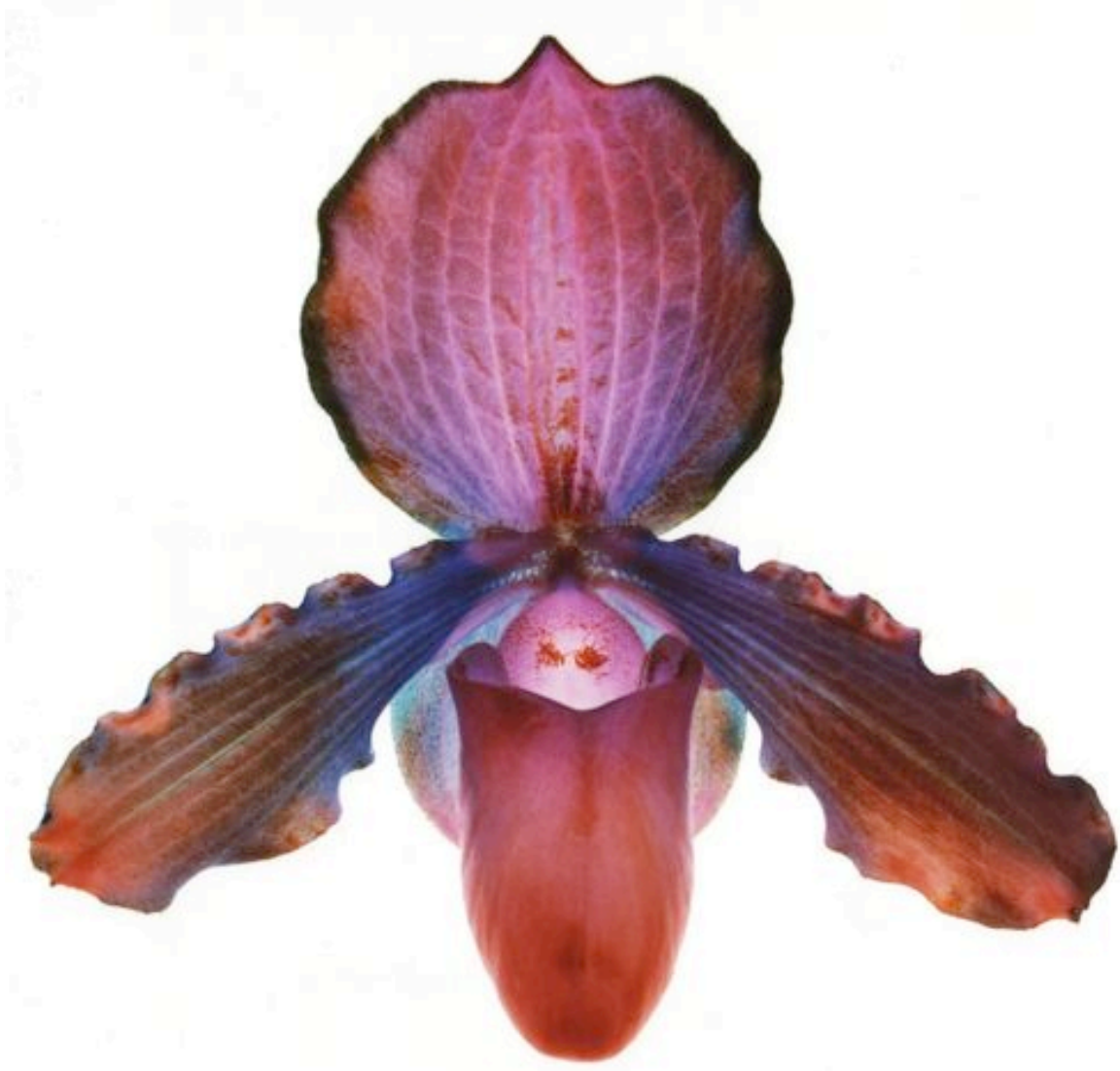
Renato Grome, Calm , 2006